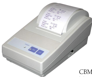
CBM-910 Miniature Dot Matrix Printer

For users requiring a GLP record from an instrument that does not support date/time printing, the DP-24 may be used, as it incorporates its own clock.