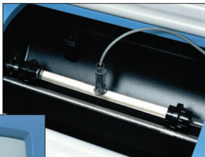
ADP410 instrument with Polarimeter tube in place.

An LED and narrow band interference filter provides illumination of the sample and requires no maintenance.