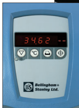
ADP410 instrument display panel.